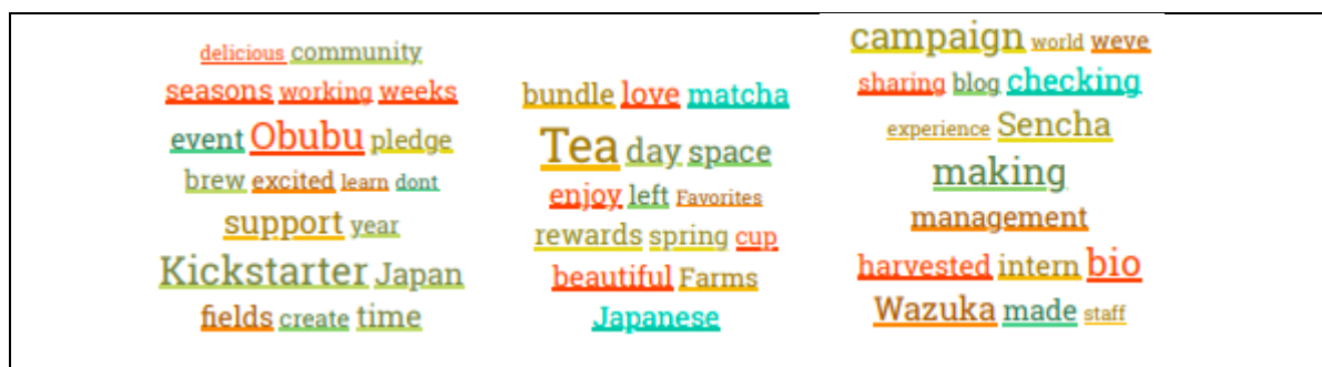
Figure 4 Top 50 words: Post interactions rate