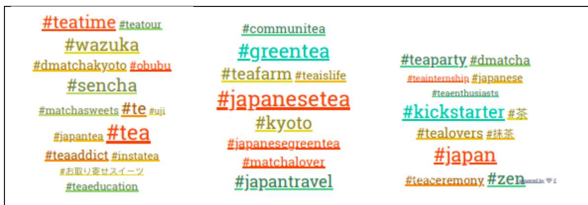
Figure 5 Top 50 hashtags: Post interaction rate