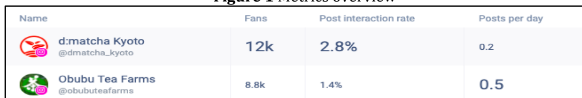
Figure 1 Metrics overview