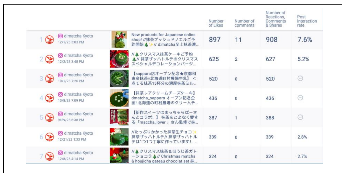
Figure 2 Top 21 contents

In terms of the number of posts per day, @obubuteafarms and @dmatcha_kyoto earn 0.5 and 0.2 respectively. It means that the intensity of @obubuteafarms uploading content is higher than @dmatcha_kyoto. @obubuteafarms uploads at least one content per two days while @dmatcha_kyoto uploads about one content per five days. However, the data shows that the frequency of uploads does not affect the follower engagement and account engagement rate. Although only a few pieces of content are updated in a few days, as long as it captures audiences' interest, there will be responses and interactions. This finding is inline with (Luttrell, 2015), in the SOME Model, posting contents that resonate with target audiences through storytelling that stimulates feelings, ideas, and attitudes can build stronger relationships with audiences. Therefore, it is essential for green tea businesses who intend to acquire high engagement on Instagram to understand the interest of their target audience and publish contents based on that preference.